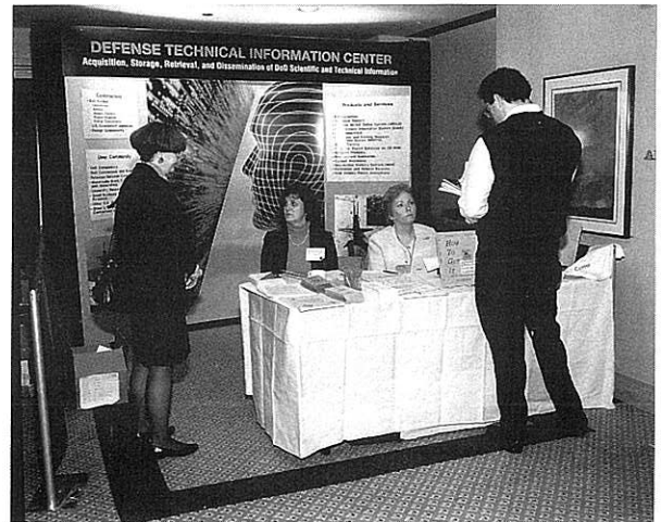
Agencies were represented, including NASA and DTIC.