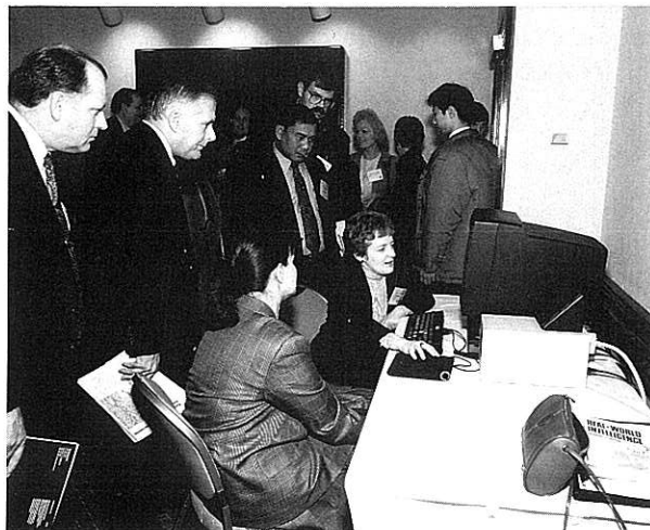
Interest in exhibitor demonstrations.