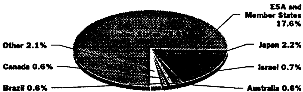
Figure 2. Percentage of U.S. versus foreign input to the NASA Aerospace Database