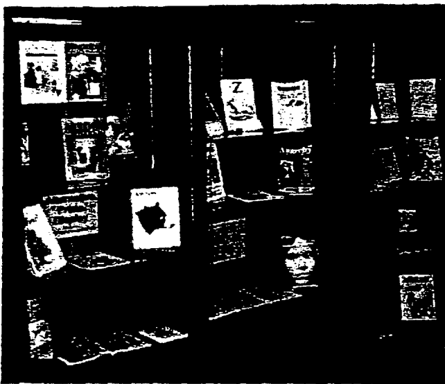
Portion of a recent alternative press display in Columbia, Missouri libraries.

ly executed projects out there that should not be missed. And you'll find a good selection of them here in this first issue of Alternative Press Review . We hope you'll subscribe, in order to continue receiving further selections. We hope you'll give us your opinions of this first, preliminary effort at presenting this varied assortment of excerpts and articles. And we hope you'll send us your suggestions for subsequent issues: the types of articles, graphic art, news coverage, reviews and features